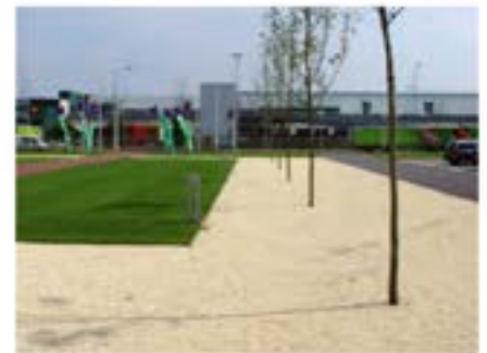
Plastic grass/gravel grids may not be laid locked up